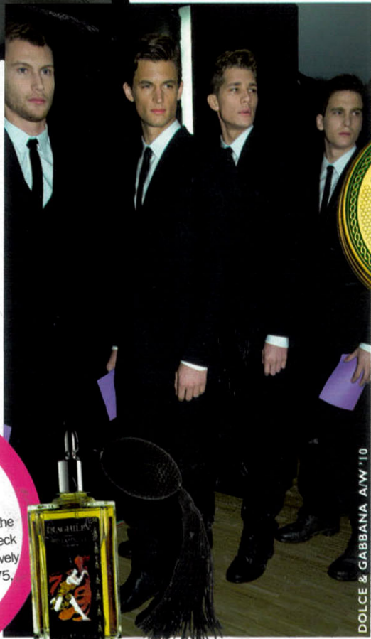
DOLCE & GABBANA A'W '10

Man up ladies, gender-bending is big news right now, with 90% of men's scents being purchased by women. Is it down to the hunks fronting the campaigns (think French hottie Gaspard Ulliel, Ryan Reynolds and Orlando Bloom), or the new fresh scents? Either way, the incredible Chanel Bleu, £42, and Hugo Boss Bottled Night, £29, are absolute lust-haves.